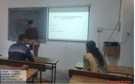
Student discussing about seminar topic